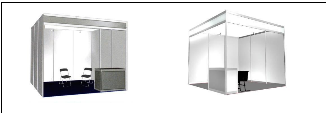
Attachment: Standard Stand and Facilities